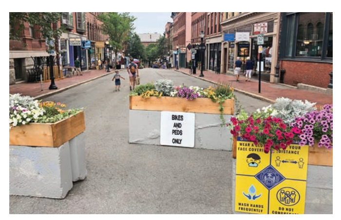
▲ PORTLAND, MAINE: To support socially distant outdoor activities, including dining, during the COVID-19 pandemic, many communities closed streets to traffic.

quickly, increases as vehicle speeds decrease. At 20 mph, about 10 percent of pedestrian strikes are fatal. That proportion increases to 50 percent at 30 mph. The 20 Is Plenty campaign has raised awareness worldwide about vehicle safety on neighborhood streets. In the United States, some jurisdictions have adopted 20 mph speed limits on neighborhood streets, accompanied by an information campaign. While posting new speed limits won't influence all drivers, doing so is a positive first step that can be followed by Stage 2 fixes.