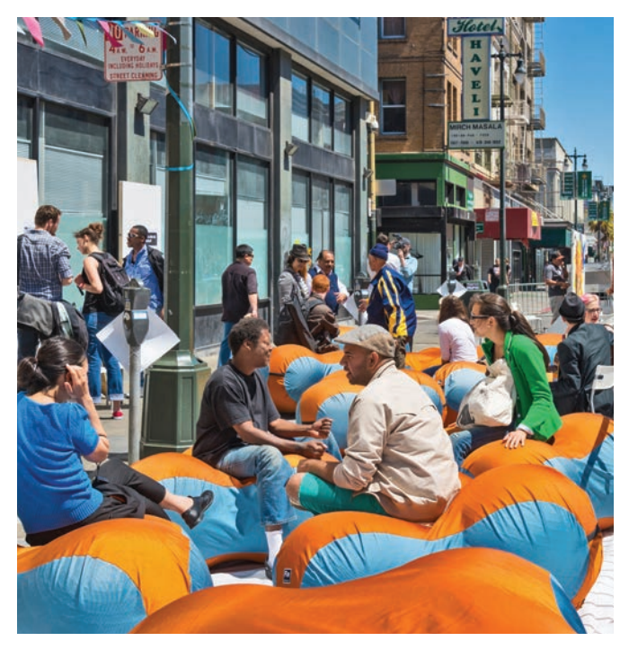
▲ SAN FRANCISCO, CALIFORNIA: Playful seating helps demonstrate the community benefits of wider sidewalks in the city's Mid-Market neighborhood.

Zoning affects the everyday lives of all community members — where they live, work and play, how they interact with one another, and what they see along the way.