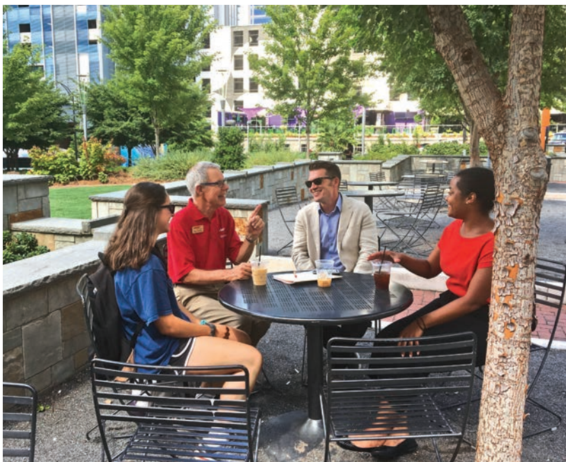
By AARP Livable Communities and the Congress for the New Urbanism