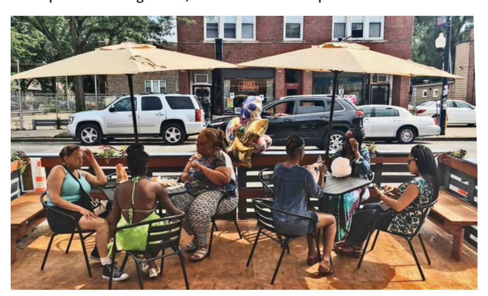
▲ CHICAGO, ILLINOIS: Parklets provide places for eating and relaxing along E. 75th Street (aka Restaurant Row) in the city's Chatham neighborhood.

n many cities, towns, suburbs and rural areas, local zoning codes and land use ordinances make it illegal to create the types of vibrant, walkable and diverse communities that foster economic development, inspire job growth and feature a variety of housing options.