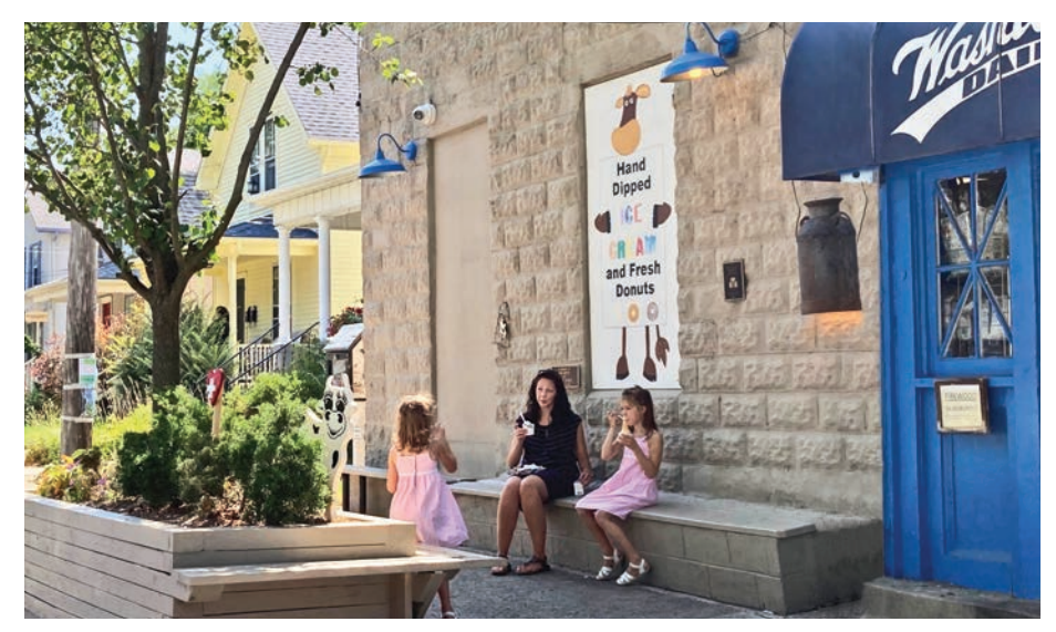
▲ ANN ARBOR, MICHIGAN: An ice cream and donut shop adjacent to housing is a sweet treat.