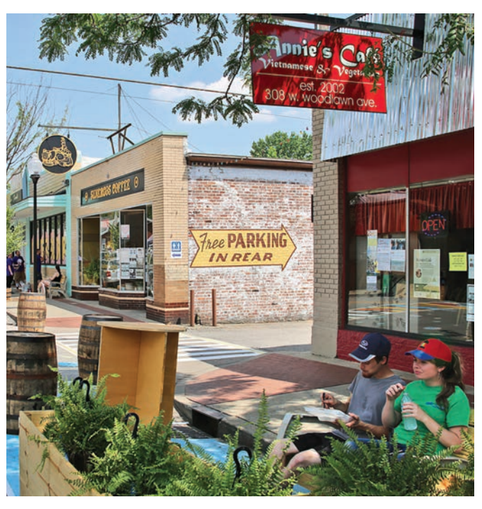
▲ LOUISVILLE, KENTUCKY: Pop-up parklets provide spots for eating and relaxing along Woodlawn Avenue in the city's walkable Beechmont neighborhood.

This usually involves contacting people from municipal government, the volunteer sector, the business community, social services and philanthropies, as well as, of course, residents.