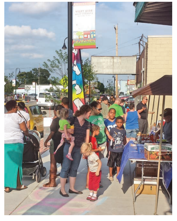
▲ SOUTH BEND, INDIANA: The West Side Main Streets Initiative improved Western Avenue's sidewalks, reduced crossing distances and added pedestrian-scale lighting.