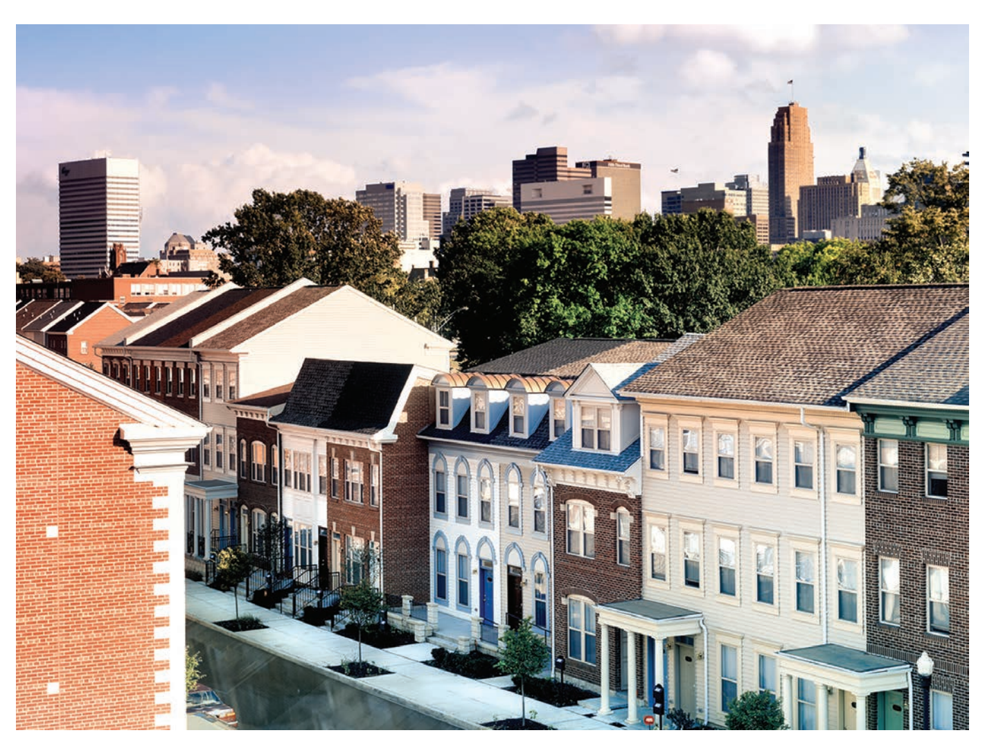
▲ CINCINNATI, OHIO: The city skyline is visible behind the Missing Middle-style homes on Betton Street in the West End. According to WalkScore.com, the location boasts a 24-minute commute by foot (or 6-minute by bike) to downtown.

Zoning reform is typically aimed first at addressing streetscape issues that have led to decline. That work is followed by reviving the historic mix of housing types found in older, traditional neighborhoods. Although many of the strategies and elements common in adjacent neighborhoods are similar to those discussed in the Downtowns and Main Streets section of this guide (page 9), the location, details and implementation differ.