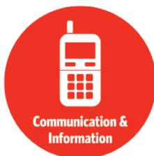
Communication & Information