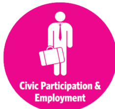
Civic Participation & Employment